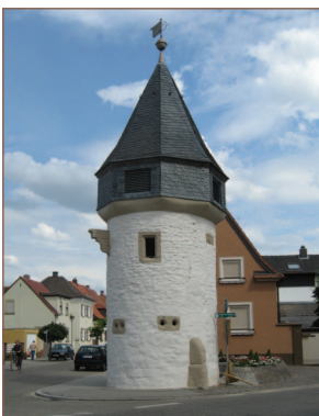
The watch tower in Lambsheim, village of the Chrisler family, which was recently restored by the town's Heimatverein.