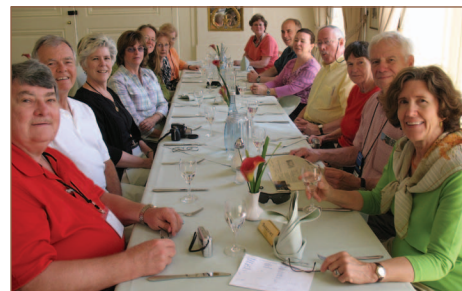
We enjoyed a superb luncheon at the Palace Café at Schwetzingen Castle after touring the castle and its exceptional gardens, considered among the finest in Germany.