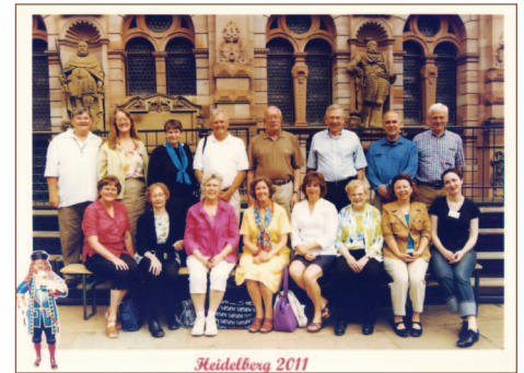
We posed with our guide in the courtyard of Heidelberg Castle for a traditional group photo.