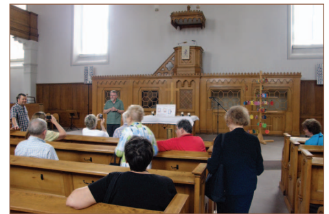
The group listens to the pastor at the Lambsheim Church.