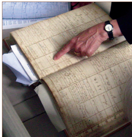
Close-up of the church register at St. Kilian's, Waldbach.