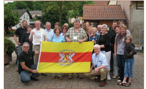
The Heimatverein in Neuenburg (home village of Blankenbaker, Fleischman, Scheible, and Thomas families) presented the group with a flag from the old duchy of Baden in which the town lies.

You may register by sending a check for $100 per person to the Germanna Foundation address, or you may register online at www.germanna.org . ■