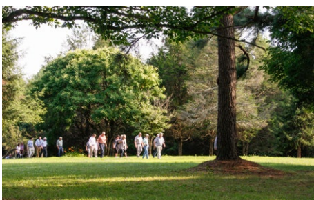
Germanna descendants walk where their ancestors first settled in America: Fort Germanna.