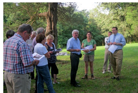
Members of the DAG group from Siegen-Wittgenstein visit the Fort Germanna site.