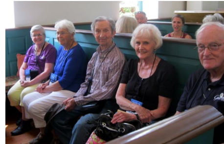
Reunion attendees experience 1770s box pews in the historic Little Fork Church.