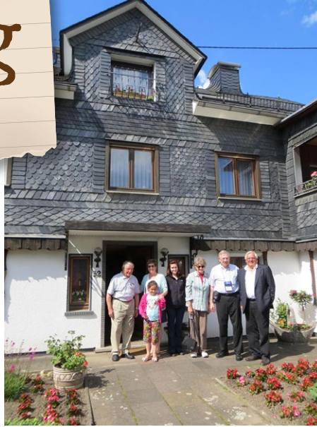
Otterbach descendants, both German and American, at the Otterbach home in Trupbach, 2013.

I never imagined that I was a Germanna descendant and, if I would not have researched further into my mother's line, I would not have known about my Germanna ancestry.