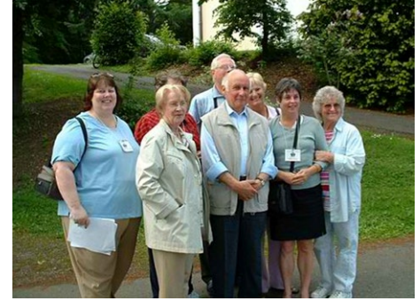
Our German and American Holtzclaw cousins in Oberholzklau, 2004.

I'm sure that I'm not the only one that has several female lines that are MISSing. What is your MISSing female line and how can we