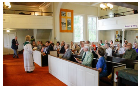
Germanna service at Hebron Lutheran Church.